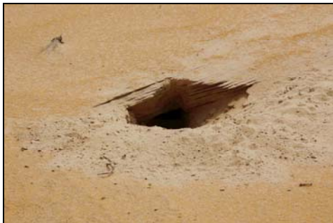
Figure 3. Rüppell's fox den in aolianite stratum in the Al Dhafra region, Abu Dhabi, UAE. The den entrance measured approximately 25 cm in width.