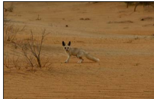
Figure 2. Rüppell's fox captured in February 2005 in the Al Dhafra region, Abu Dhabi, UAE.

In February, we captured and marked four adult (>1 year old) male Rüppell's foxes (Figure 2). In March, we captured five adult foxes, including three males and two females. We re-captured one of the males previously caught in February. In April, we re-captured one adult male that had been trapped in February. Body weights of foxes varied from 1,070g to 1,630 g (Table 1). Morphological measurements were similar to those reported from Mahazat as-Sayd Protected Area in Saudi Arabia (Table 1; Lenain 2000). Some of the foxes ( n = 4 ) retreated to dens following release. All of the dens were located in aeolianite deposits in gravel plains or between sand dunes (Figure 3).