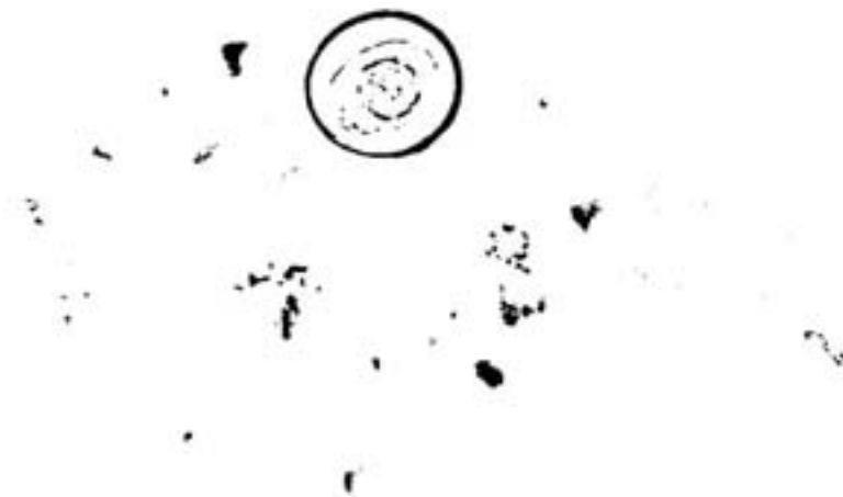
Caryospora falconis from a peregrine falcon

The presence of the protozoa in the digestive tract of birds does not always constitute a disease process and depend on host resistance, immune status, level of parasitemia, and concurrent bacterial, viral and fungal infections. However, affected falcons with high parasitic levels of Caryospora sp may show anorexia, depression, vomiting and diarrhoea.