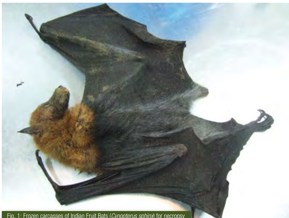
Fig. 1: Frozen carcasses of Indian Fruit Bats ( Cynopterus sphinx ) for necropsy

Until 50 years ago there were no reports of rabies in bats in South-East Asia, and publications of the World Health Organization state that surveys of bat rabies in Asia have been consistently negative (Duttka, 1997). However, Rabies Virus was isolated from Fruit Bats in Thailand for the first time in 1967, (Smith et al., 1967). In a recent study (Lumlertdacha et al., 2005) a total of 932 bats of 11