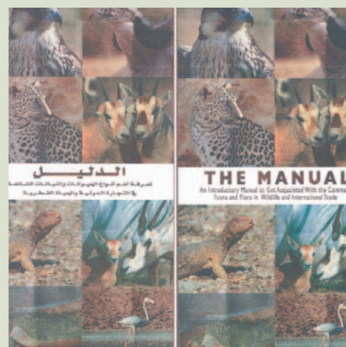
Fig 1. Cover of a species identification guide for customs officials produced by the CITES authority.

A pdf of Federal Law (11) of 2002 for “Regulating and Controlling the International Trade in Endangered Species of Wild Fauna and Flora” can be downloaded at www.wmenews.com/