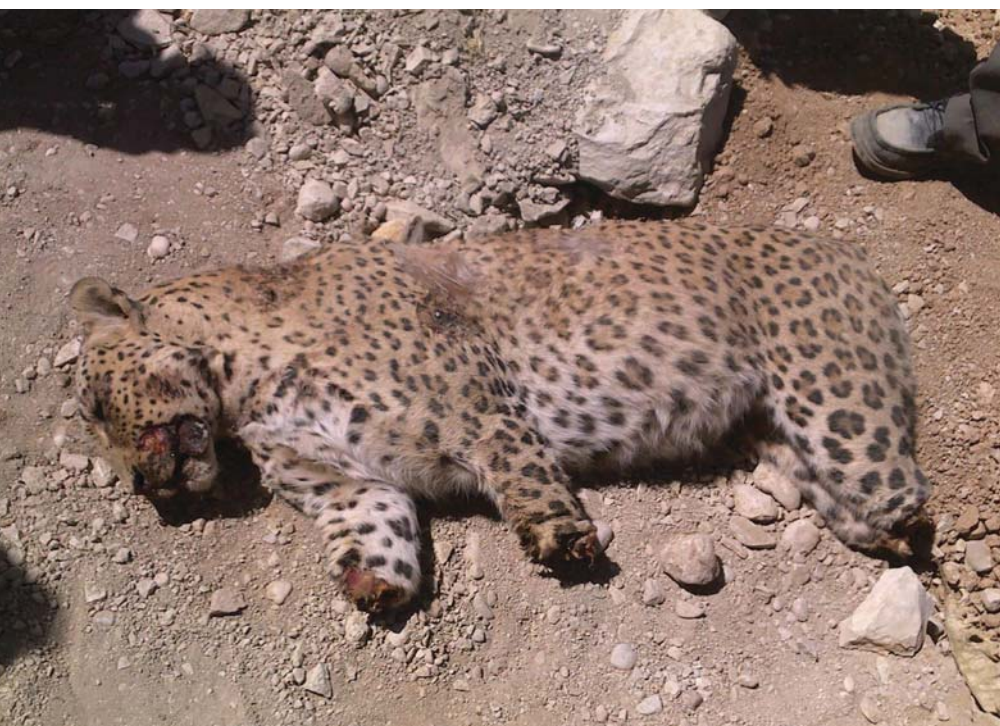
Fig. 1: A male Persian leopard poached at vicinity of Yasuj, Iran. Paws, tail, moustache and eyes are removed probably for traditional medical purposes.

Traditionally Iranian culture has had a long association with wildlife which is evident within many traditional rituals. The "12-animals calendar", inherited from the Mongol invasion of the 13th century,