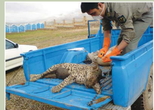
Fig. 3: Female Persian leopard (probably) poisoned by local people in Pol Dokhtar, Lorestan. Carcass of her two cubs found some kilometers away at Golgol.

References: Full references can be found on website www.wmenews.com